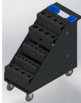
BB-15-0 Kart with 5 Tool Holder Racks Installed