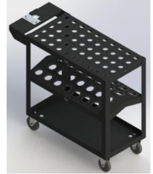
BB-3001 Kart w/ Optional DA Shelf and Locking Fixture