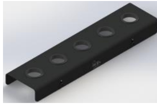
BB-9-1 Anti-Tip Shelf - Recommended for long (8"+) or nose heavy tools