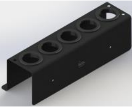
BB-9-0 Tool Holder Rack